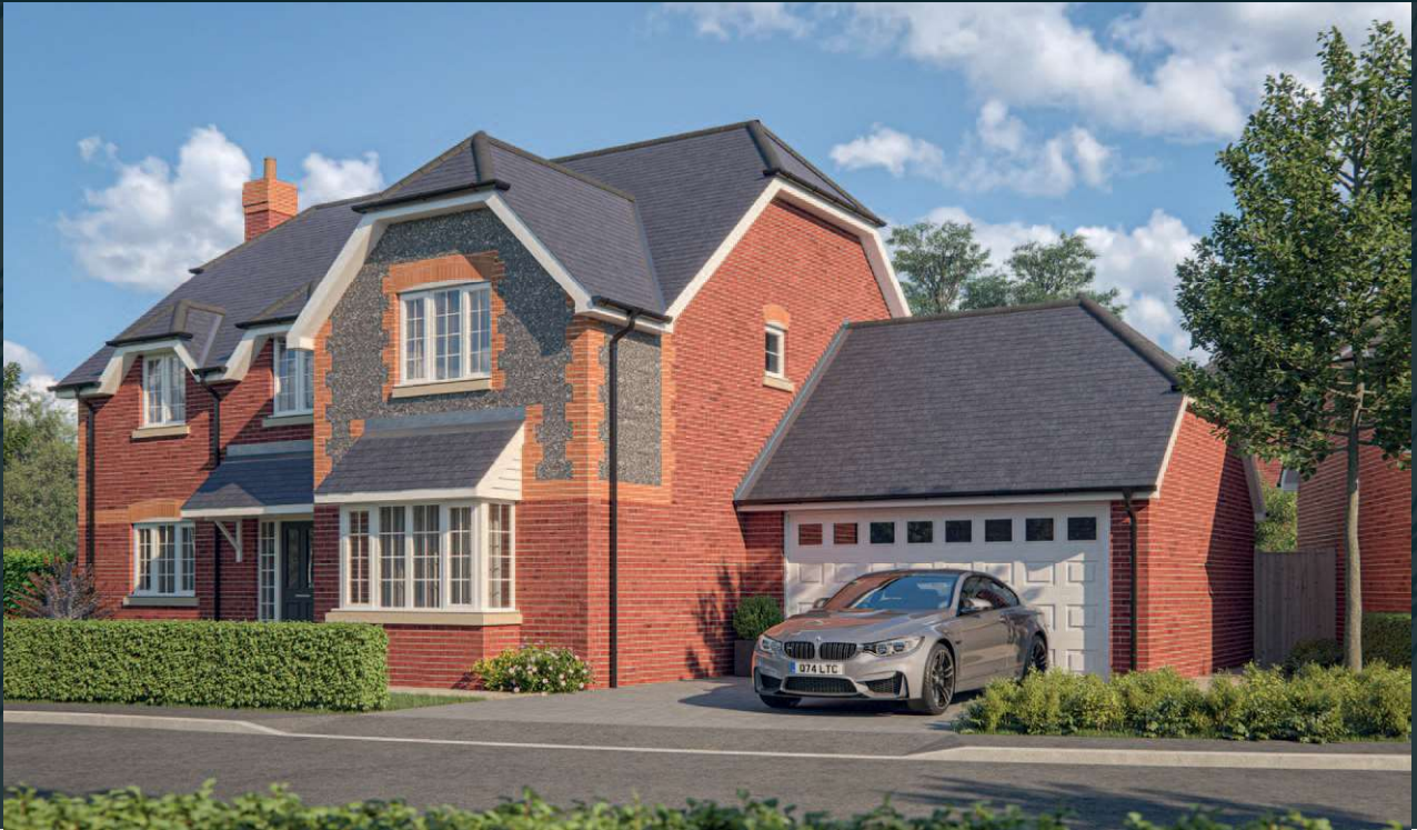
Computer generated image is indicative only and shows plot 20