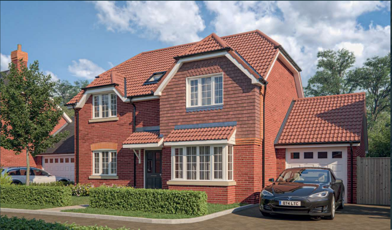
Computer generated image is indicative only and shows plot 15